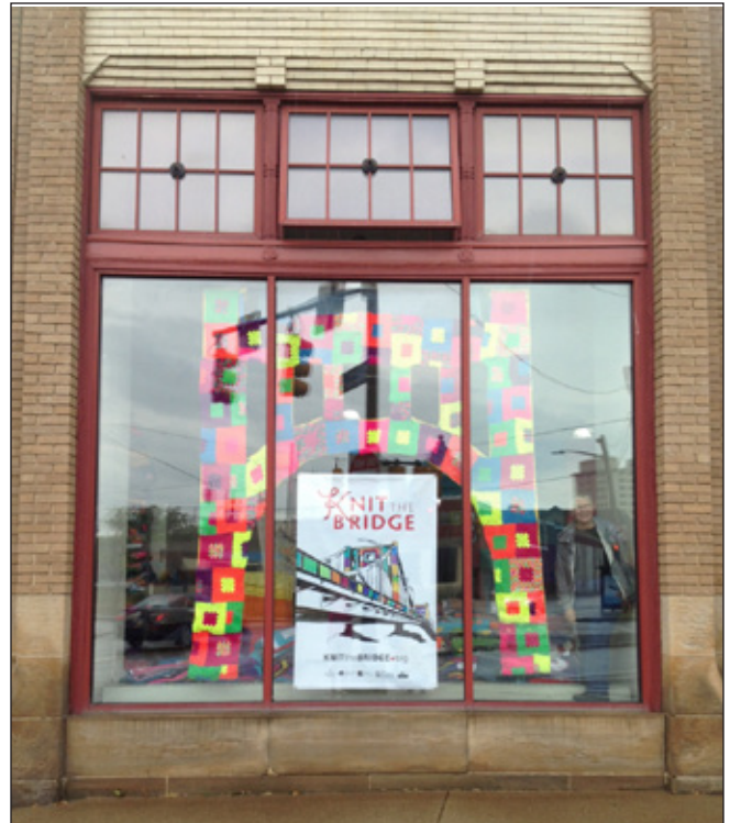
Knit the Bridge panels have a home at the Spinning Plate Lofts Gallery... come visit!

We've launched an online fundraising campaign. When lots of folks give small amounts it adds up. Help us fund Knit the Bridge by donating and sharing the link with your networks. If you've knit or crocheted for the bridge, this is a great way to get your friends and family to support your work. http://igg.me/at/knitthebridge/x/2767579