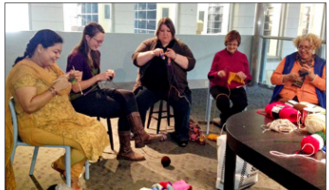
Knitting at the Carnegie Museum of Natural History (above)