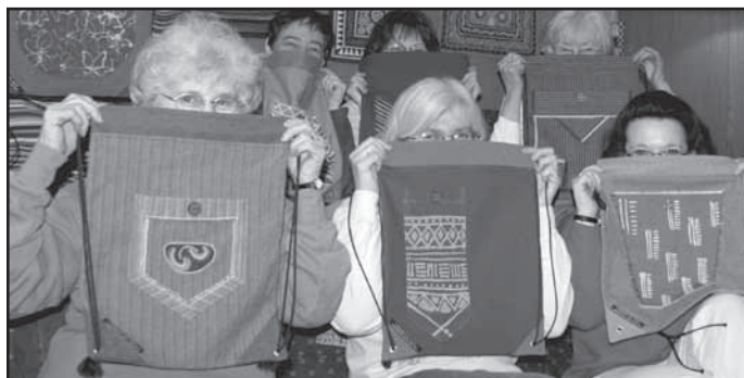
Roo Bags: those wonderful one-of-a-kind tote bags made from denim. $20