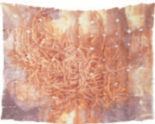
JENNY KIMBALL United States Garlic Skin, Out | 2002 Silk (recycled industry waste). Digital image printed on silk. 45" x 60" SECOND PLACE AWARD