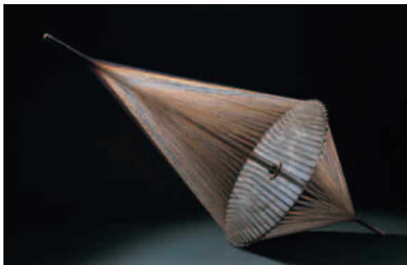
RANDY WALKER United States Radial Saw Piece | 2003 Found saw blade, threaded steel rod, nylon thread, copper wire. Thread wrapped from one side of blade to the other, using the teeth to generate conical form. 50" x 30" diameter THIRD PLACE AWARD