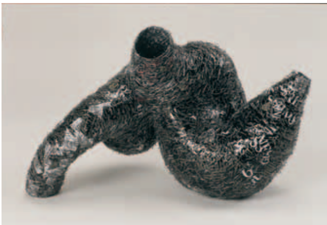
JERRY BLEEM United States Ferment 2000 Aluminum cans, staples. Accretion or agglomeration by stapling. 9.75" x 12.75" x 6" THIRD PLACE AWARD