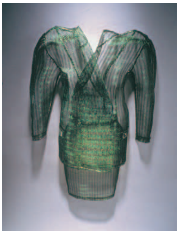
NANCY JONES WETMORE USA , Inc. | 5' X 3' | Weaving.

Handwoven copper and steel wire; masonry nails