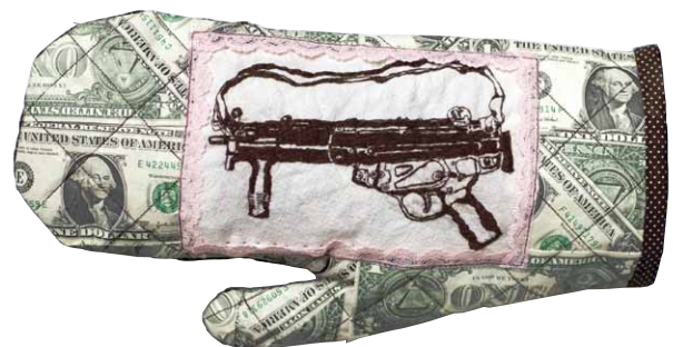
Potholder: Domesticated #2 Fiberarts International 2010

Domesticated: the exhibit , has just been the start of me exploring how art can be used to think critically, understand, and practice working through conflict, both internationally and interpersonally. Most recently I've been delving into the world of theater of the oppressed, playback theater, and fiber graffiti. And these are some of the many things I've been contemplating while driving down 30 West.