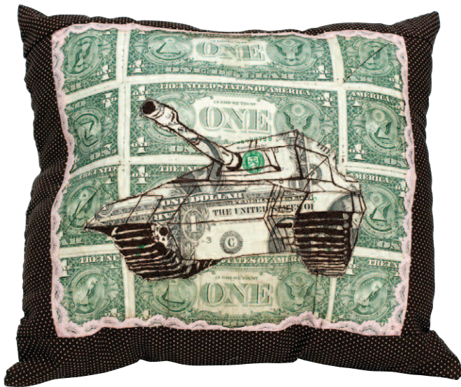
Pillow: Domesticated #1 AAP Centennial Exhibition 2010